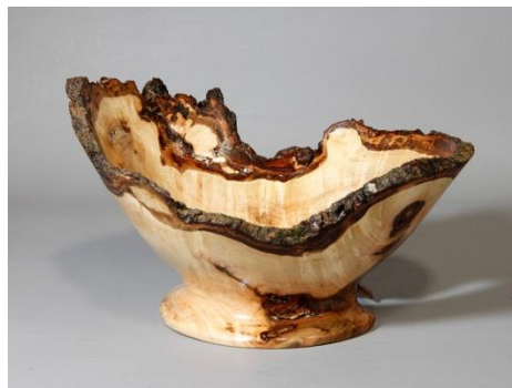
Matt Larson – Maple Natural Edge