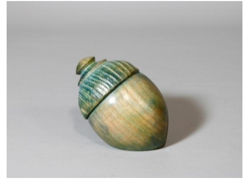
Jim Barbour – Maple Acorn Box