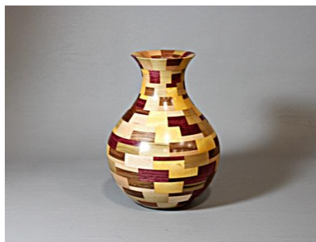
Floyd Lucas – Segmented Vase