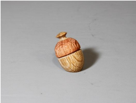
Jim Barbour – Oak Maple Box