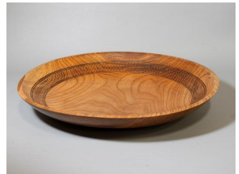
Lan Brady – 14” “Triple M” Elm