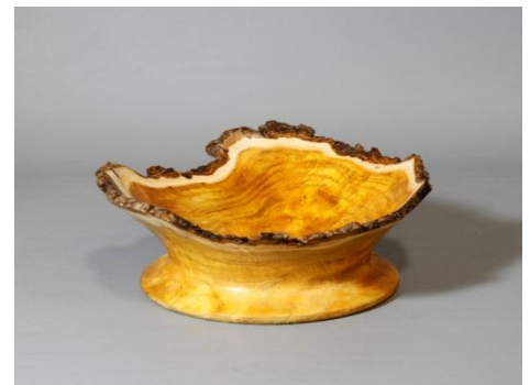
Matt Larson – Maple Natural Edge