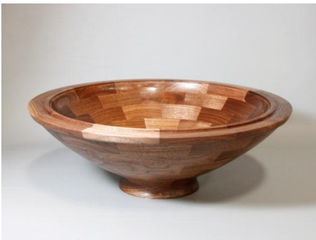
Dean Hutchins – Walnut Segmented