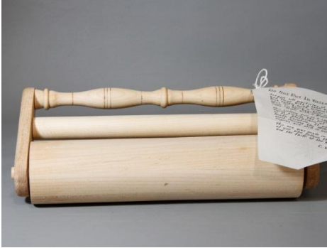
Clyde Mosley – Maple One-Hand Rolling Pin