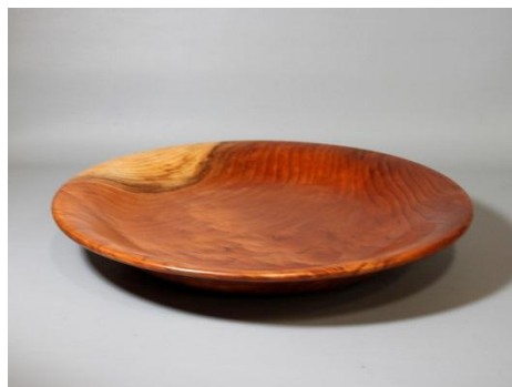
Earl Kennedy – Redwood Platter