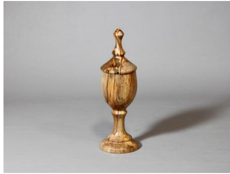
Jim Yarbrough – Ambrosia Maple Lidded Box