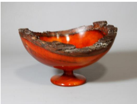
Earl Kennedy – Dyed Pecan Natural Edge