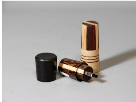
Nim Batchelor – Flash Drives Palm/Maple/Ebony, Rosewood/Maple