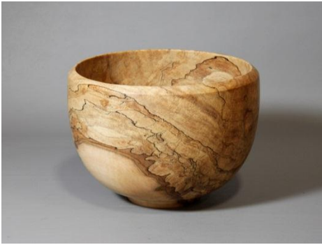
Pat Lloyd – 6” Red Maple Burl