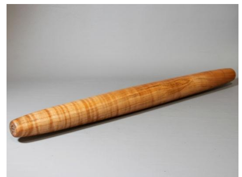
Jim Raine – Maple French Rolling Pin