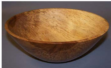
Lan Brady maple bowl