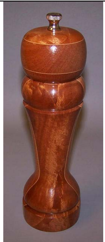
Gene Briggs crotch mahogany peppermill