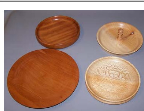
Clyde Mosley various turnings