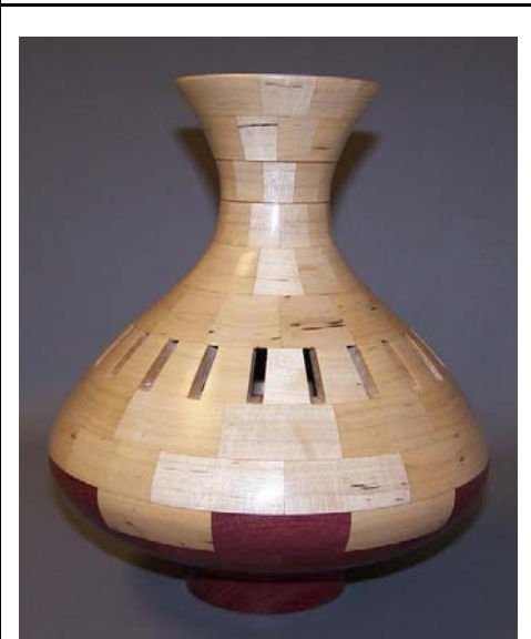
Jim Schoonard maple and purple heart segmented vessel