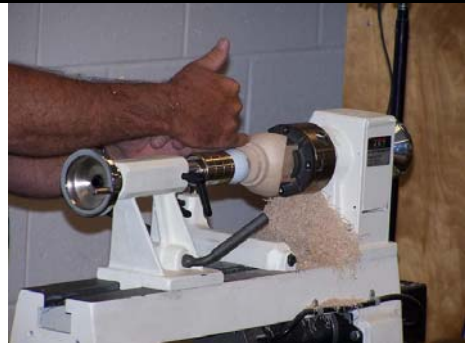
Mark's clever golf ball jam chuck