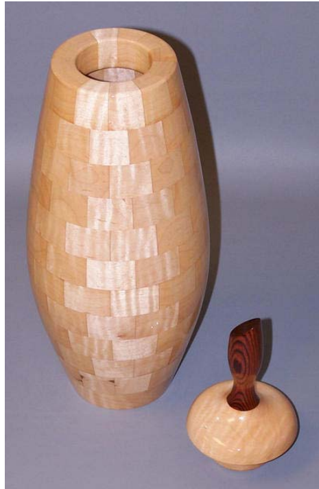
Glenn Marceil curly maple and kingwood lidded vase. The fit is so exact that it POPS when removed quickly!