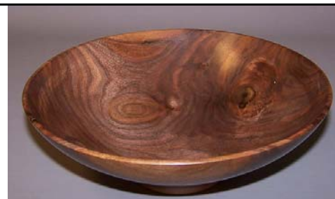
Bob Moffett walnut bowl