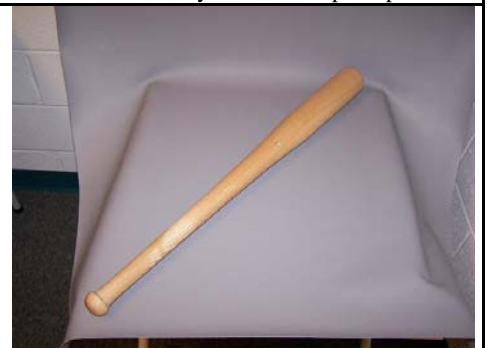
Wes Adams ash baseball bat