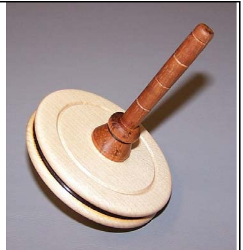
Jim Duxbury Koa and maple top