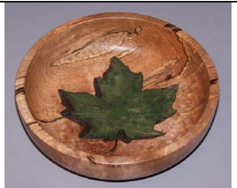
Vicky Tanner mystery wood bowl