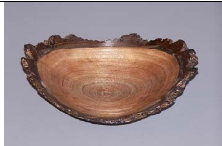
Bob Moffett: walnut natural edge