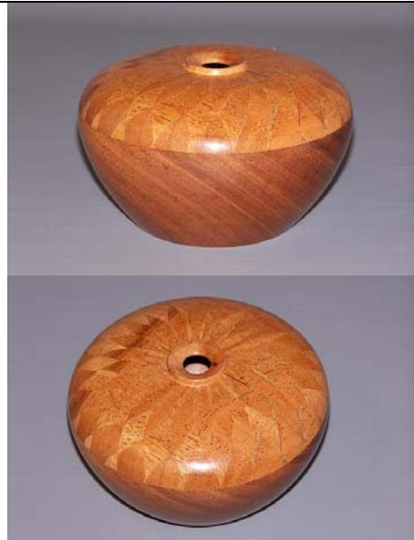
Lan Brady: polychromatic mahogany vessel