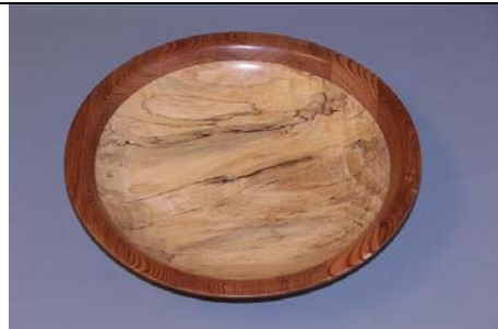
Bert Rau: mixed woods, rimmed platter

You can see the color versions by going to the newsletter section of our website or by visiting the website at ( http://albums.photo.epson.com/j/AlbumIndex?u=4274086&a=31745886&f= )