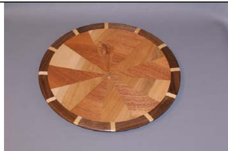
couldn't read the name