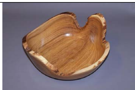
Earl Kennedy: locust natural edge