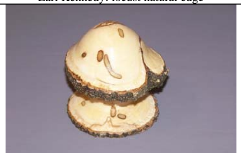
Earl Kennedy: mushroom-wood unknown