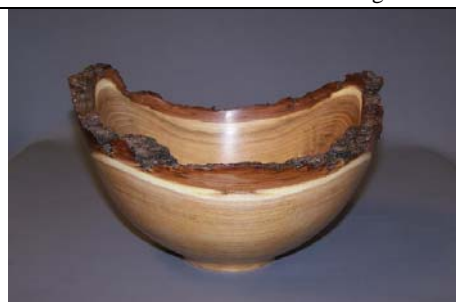
Earl Kennedy: locust natural edge