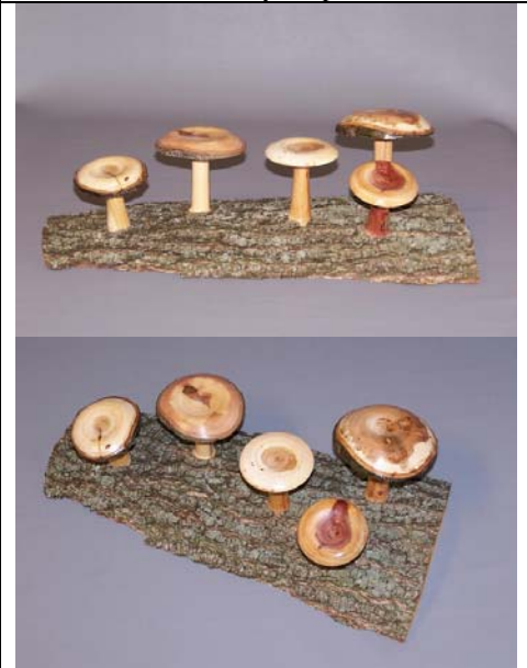
Jim Terry: mixed mushroom log