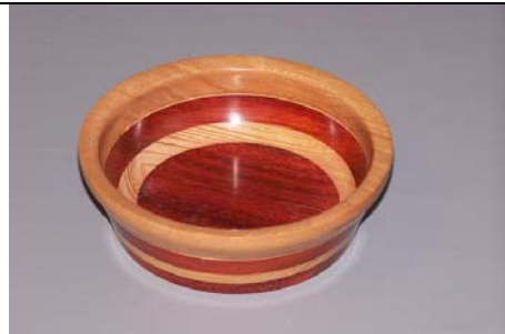
Bert Rau: mixed woods, small bowl