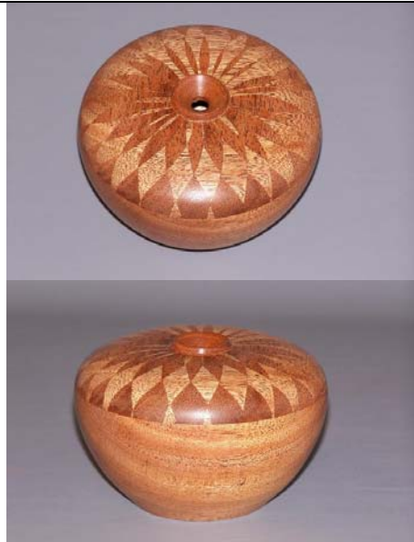
Lan Brady: polychromatic mahogany