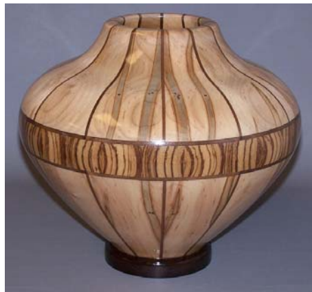
Glenn Marceil: compound stave bowl, bookended staves spalted maple-wenge-zebra-walnut