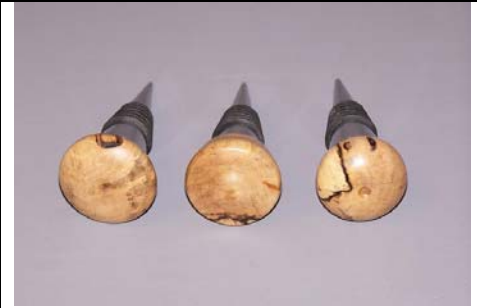
Jim Barbour: spalted holly bottle stoppers