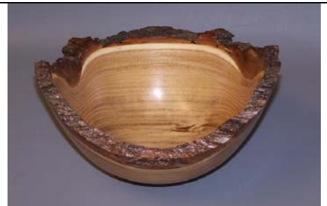
Earl Kennedy: locust natural edge