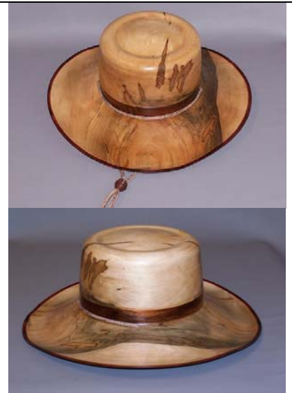
Jim Duxbury: maple hat