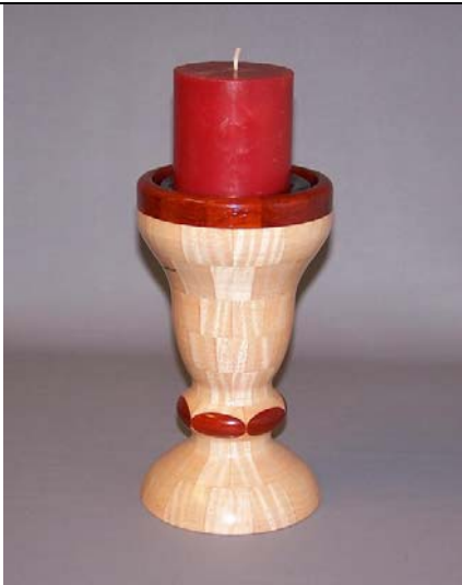
Glenn Marceil: candle holder-figured maple and padauk