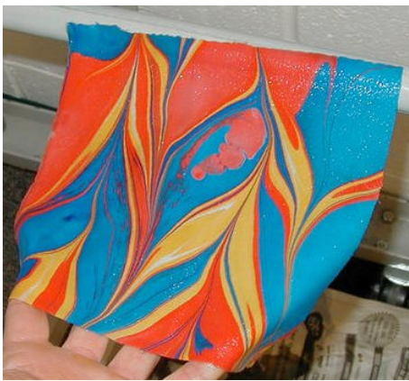
Marbling on cloth. First run.