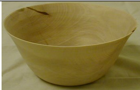
Earl Kennedy-Sweet gum bowl