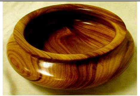
Edgar Ingram-Canarywood bowl