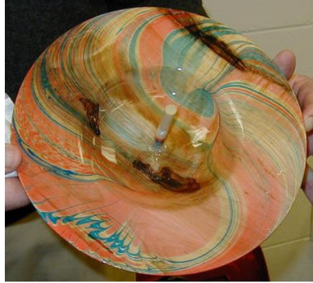
Swirled effect-He ends up a 7!