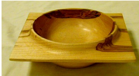
Edgar Ingram-Square edged maple bowl