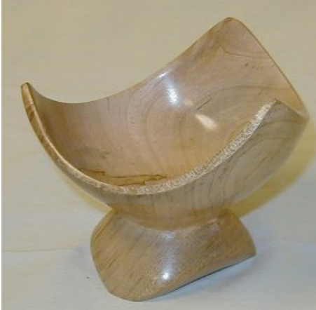
Edgar Ingram-Three pointed maple bowl