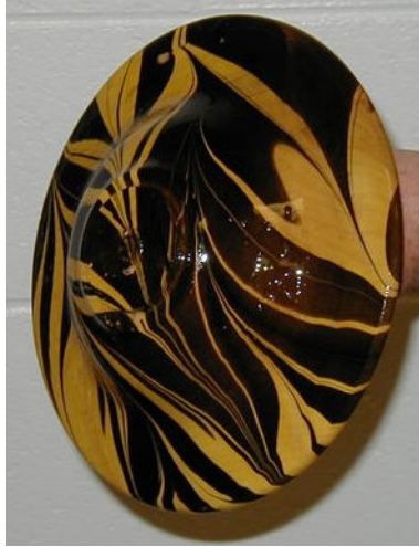
Demonstration marbled bowl bottom