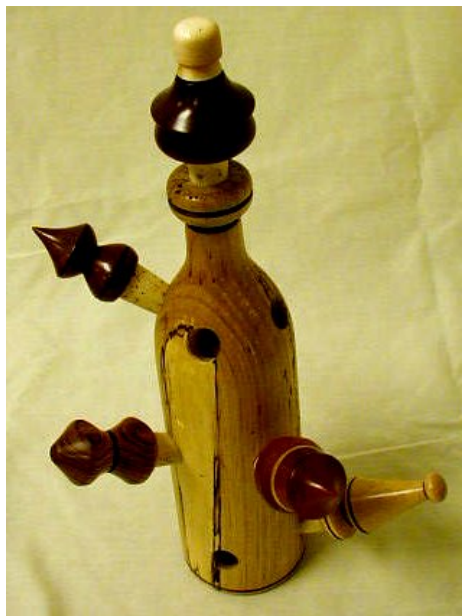
Jim Duxbury-Wine stoppers