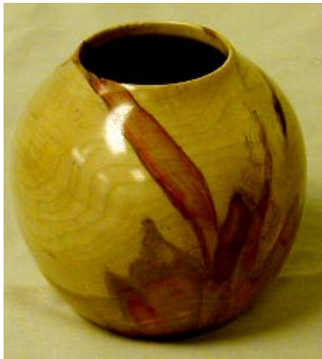
Gene Brigs-Boxelder vase