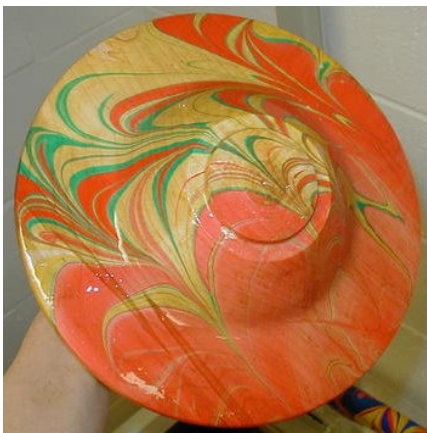
Marbled bowl bottom