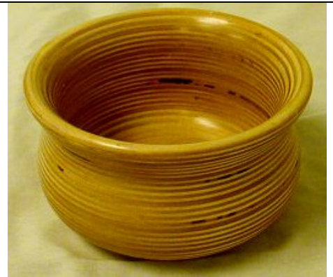
Phil Atkins-Birch plywood bowl