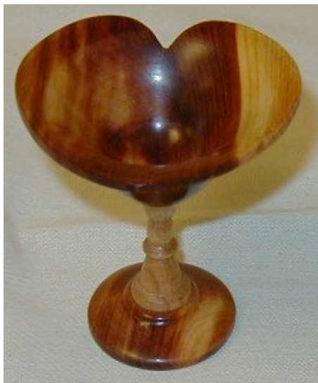
Earl Kennedy-Cedar heart and foot with maple