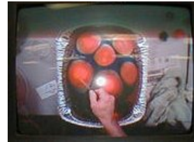
View of the “stones” from above.

The bath must be allowed to macerate for 3-4 hours before use. It becomes very thick. It is about the consistency of Metamucil as noted by one of the hecklers in the crowd. Drops of the diluted colors are placed on the surface of the bath (carefully) with an eyedropper. Eckess seemed to favor a 5 drop pattern much like on dice. These drops form “stones”