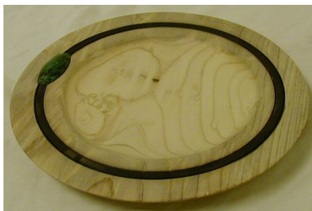
Jim Barbour-Magnolia platter with malachite jewel