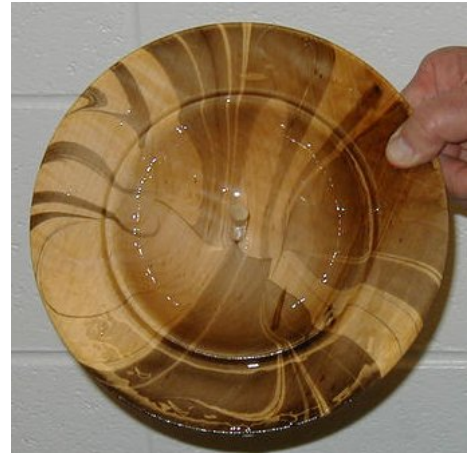
Same bowl as at left: Lighter inside