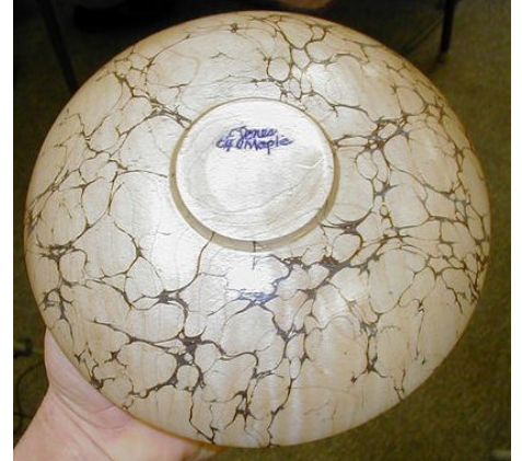
Marbled bowl (Looks like natural spalting)