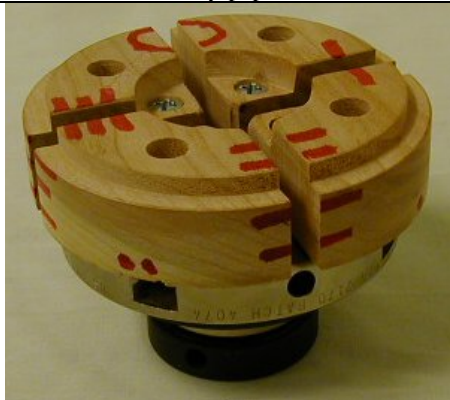
Jim Duxbury-Chuck jaws