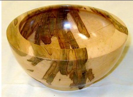
Edgar Ingram-Maple bowl