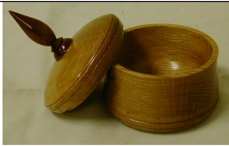
Earl Kennedy-Oak lidded box