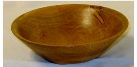
Jim Yarbrough-Maple bowl