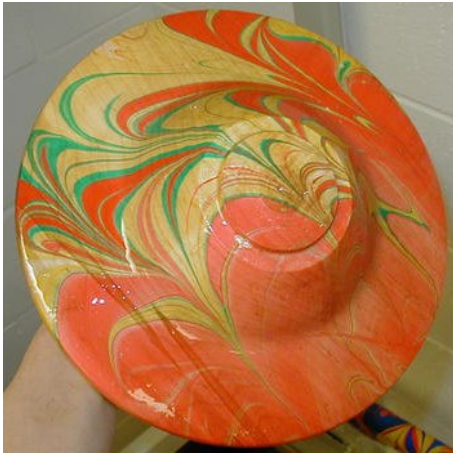
Demonstration marbled bowl bottom