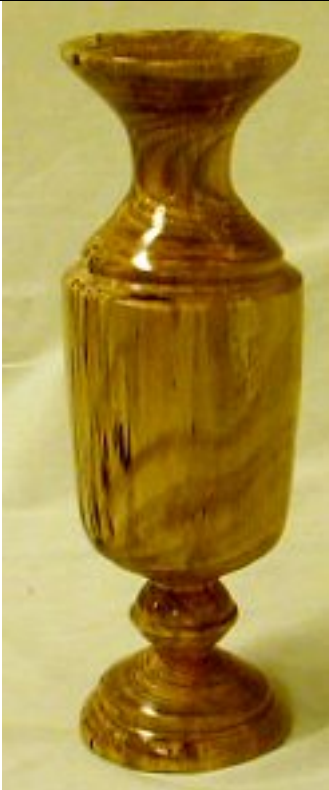
Jim Schoonard-Maple vase