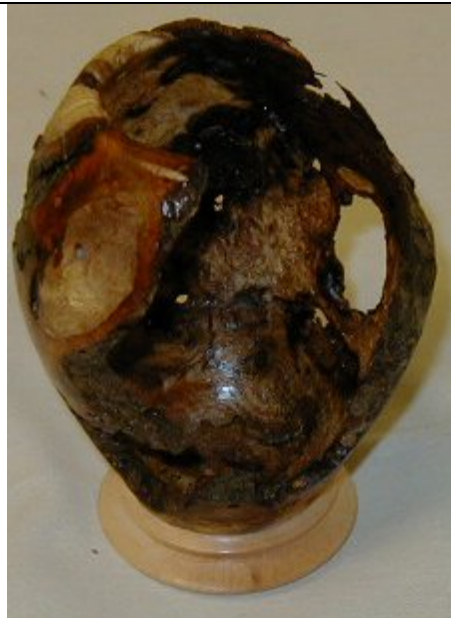
Earl Kennedy-Cherry open turning