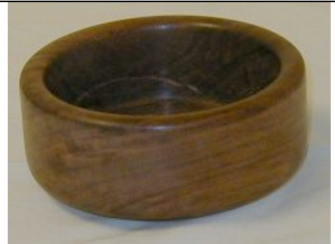
Dustin Pitts-Walnut Bowl