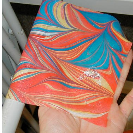
Marbling on cloth. Second run.