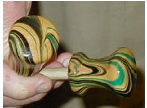
Marbled Bottle Stoppers