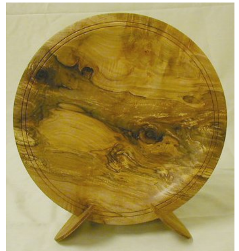
Roy Fisher-Maple burl plate