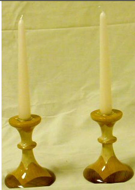
Glenn Marceil-Candlesticks of yellowheart-holly-poplar