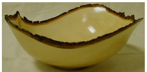
Earl Kennedy-Natural edge maple bowl