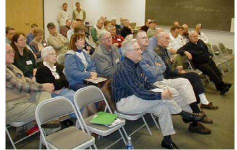
Members in awe!