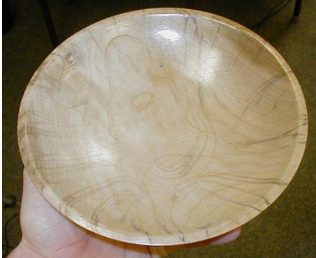
Different bowl: Nice effect inside