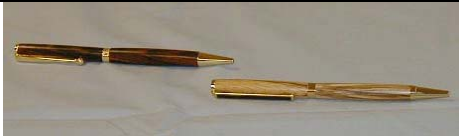
Jim Yarborough Pens