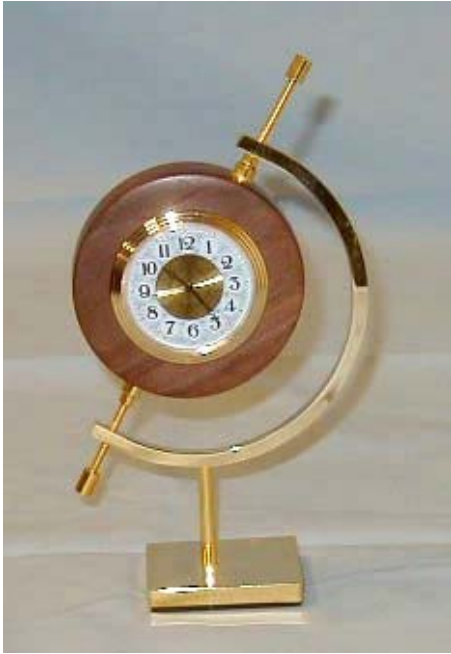
Edgar Ingram Suspended clock