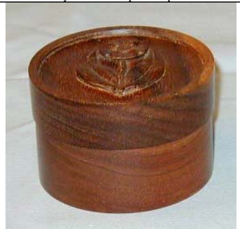
Tom Deering Carved box