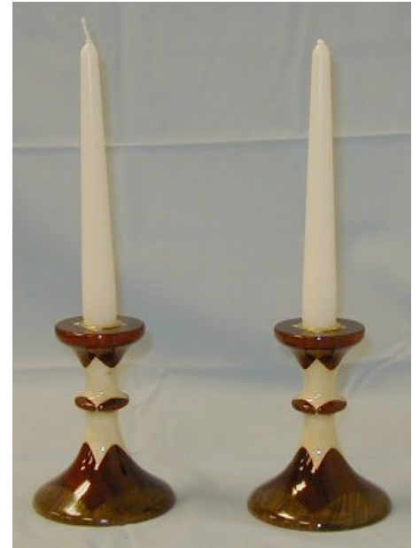
Glen Marceil segmented candle sticks