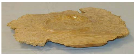
Edgar Ingram Maple platter