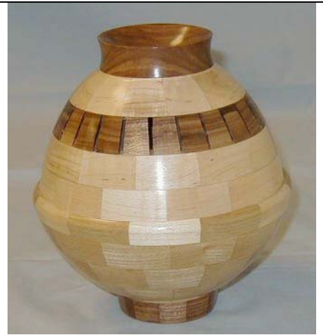
Jim Schonnard Segmented closed form