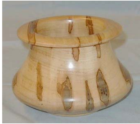
Jim Terry Ambrosia maple closed form