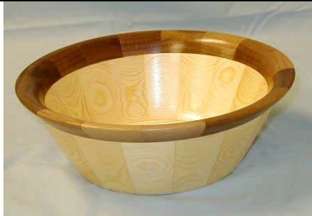
Butch Hadley pine & walnut staved bowl