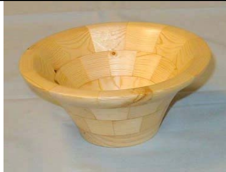
Butch Hadley Pine segmented bowl