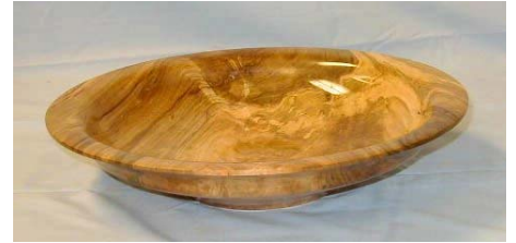
Edgar Ingram Maple bowl