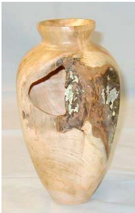
Edgar Ingram Hollow form